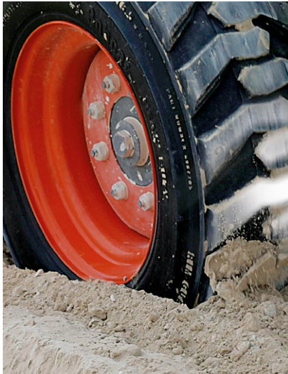
CUVED LUGS IMPROVING TIRE CLEANOUT