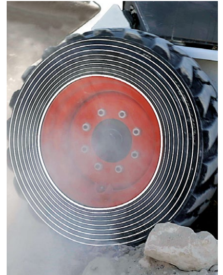
TOUGH SIDEWALL FOR MAXIMUM PROTECTION