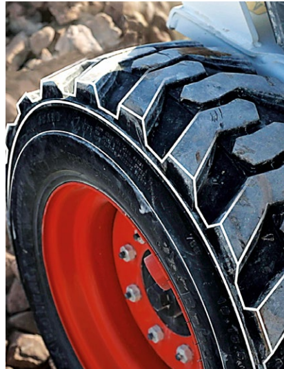
DEEP THREAD FOR MAXIMUM TRACTION